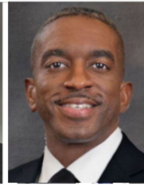
Mel Franklin - Prince George's County Councilman [ read more ]