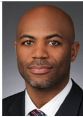
Ereik Barron - Prince George's County Delegate [ read more ]