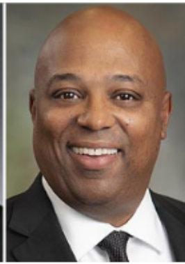
Calvin Hawkins - Prince George's County Council vice chair [ read more ]